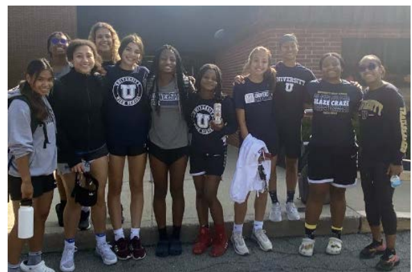
Girls Basketball Team Volunteers at Camp for Kids