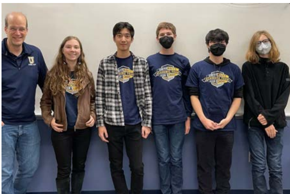
Academic Team Improves