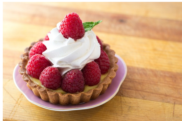
Peer Tutors & Facilitators